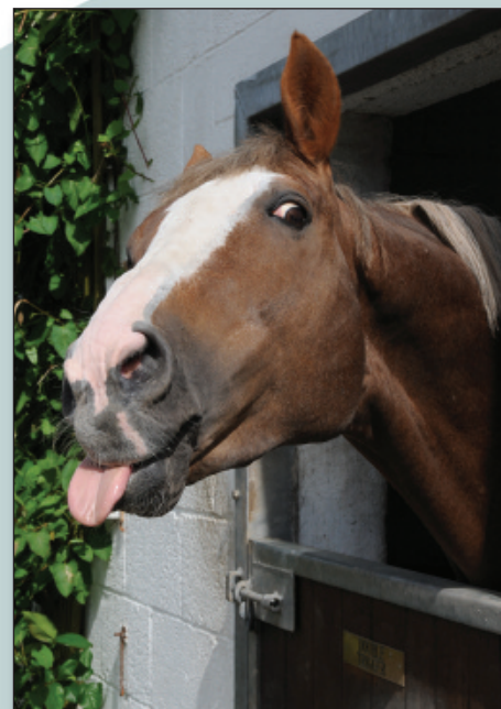
3rd June, East Burrow Farm, Devon Double Trigger : 'Give an inch and he will take a mile...'