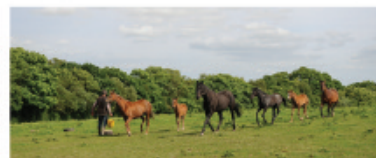
3rd June, East Burrow Farm, Devon John's (right) is doing just ahead of the others for the time. Caption: 3rd June, East Burrow Farm, Devon The race is Double Trigger and the lead is by the stable Aid (right). The foals are not named and they are purchased to race.