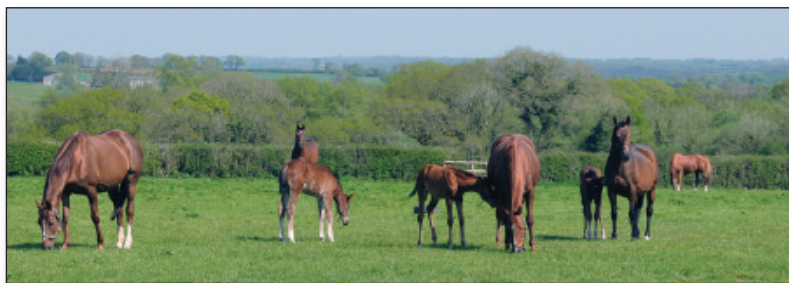
7th May, East Burrow Farm, Devon A field of East Burrow Farm-owned mares and foals.