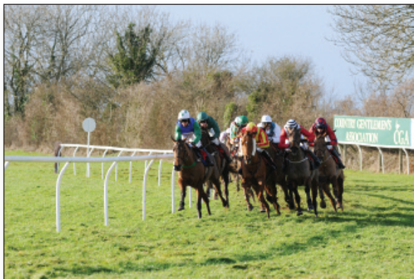
5th January, Wincanton Racecourse 1.10pm The Higos Insurance Somerton Novices' Handicap Hurdle Race (Class 4).